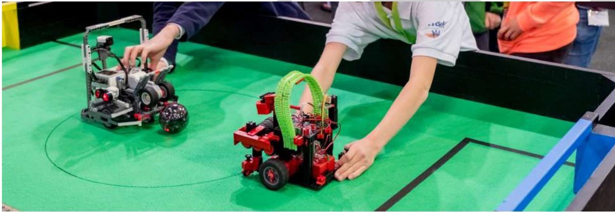
Figure 1 Two teams with one LWL robot each will compete using an IR ball on RCJ Soccer fields without the out-area. There is no need for using camera vision or line detection.